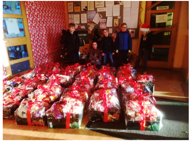
Boys and girls who helped pack the Christmas Hampers!