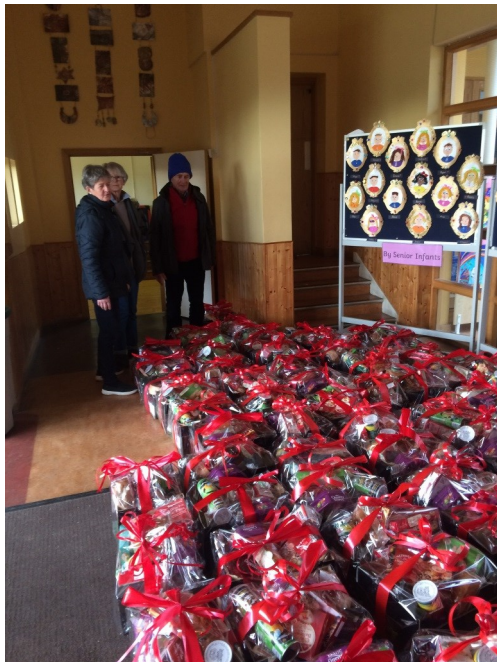
Hampers lined up and ready for delivery!