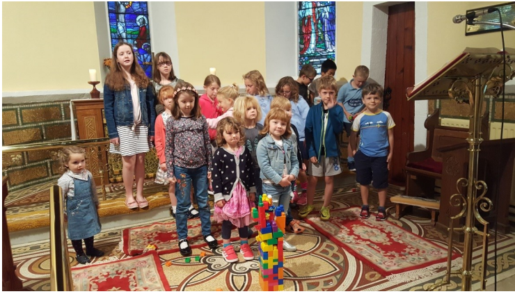
Sunday Club built a Lego church during Family Service