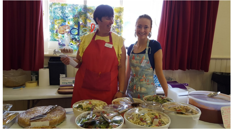
Delicious Deli delights at the Fete