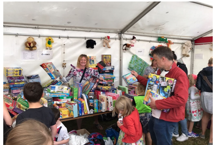
Lots of toys to choose from