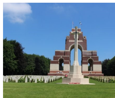
Thiepval War Memorial

Oh God, let me know it the end of man's fever! Make my last breath a bugle call, carrying Peace o'er the valleys and hills forever!