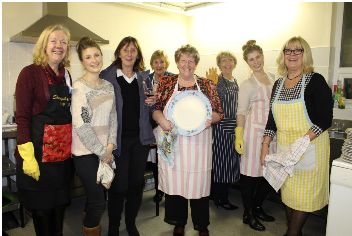
Somebody had to do the dishes