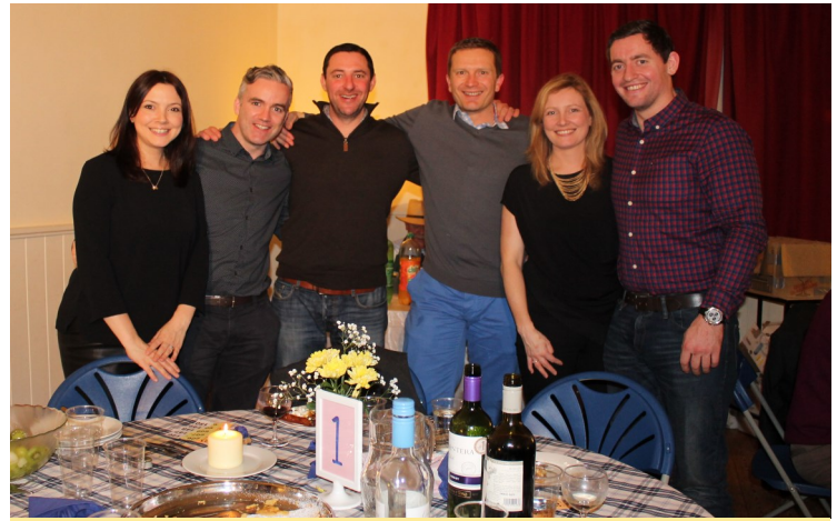
The Young Ones