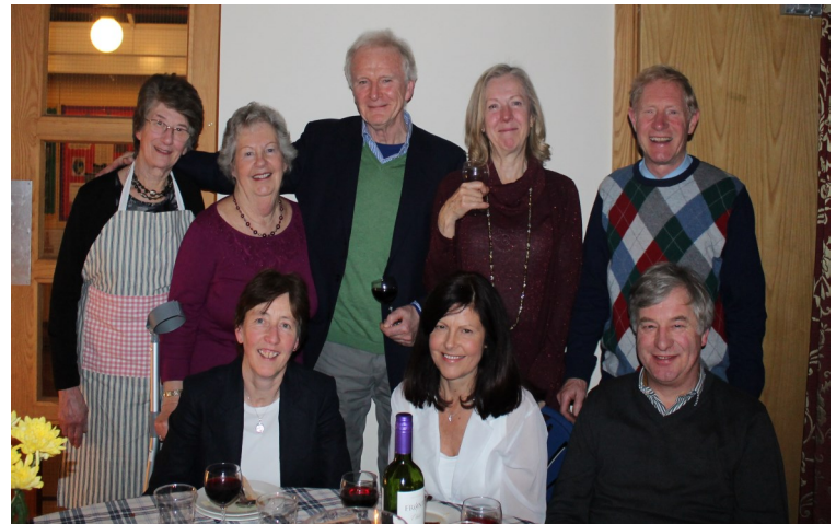
Enjoying the evening