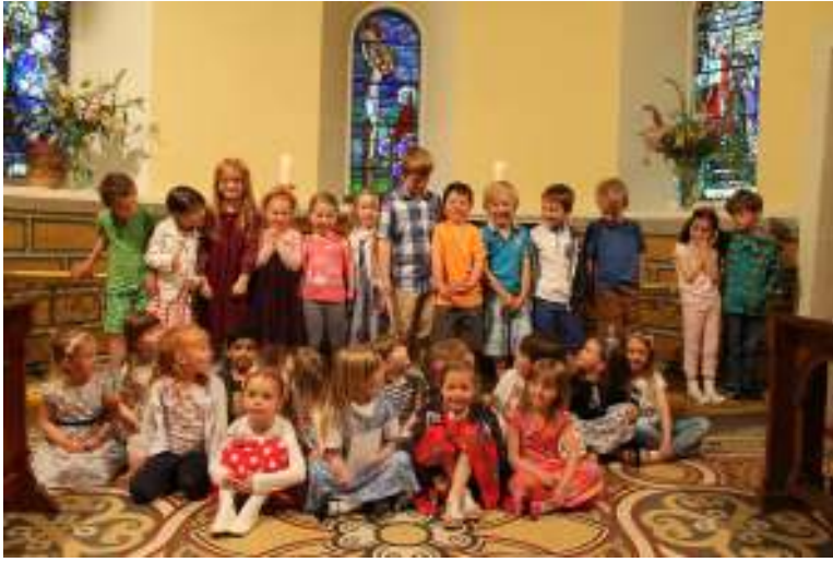
The Junior Group

Congratulate to all the girls and boys and we look forward to seeing them in September when Sunday Club re-opens.