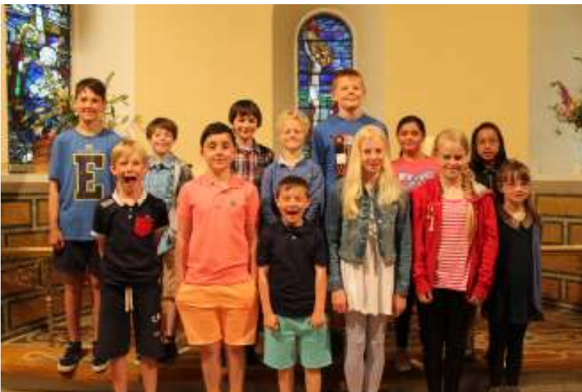
The Senior Group