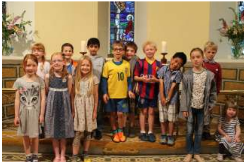
The Middle Group

Congratulate to all the girls and boys and we look forward to seeing them in September when Sunday Club re-opens.